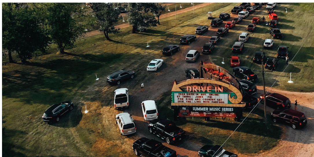
The 13-24 Drive In was a hotspot all summer and fall! The outdoor atmosphere allowed for safe, socially-distanced, and much-needed family entertainment including the free Summer Music Series, several live concerts, and of course... movies.