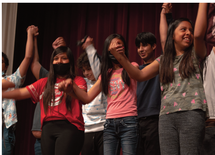
Honeywell Arts In Education partnered with Arts Midwest to present We the Many, a performing arts residency that connects artists of color and communities to promote the creative exchange of voices, cultures, and ideas. Your support helps the continued growth of Arts In Education. That growth was a factor in Wabash being one of only three communities selected for the pilot program in 2021.