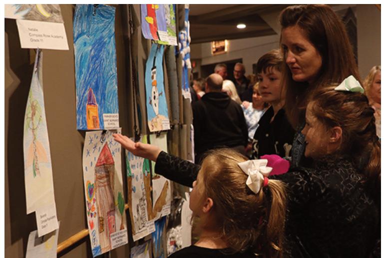
The annual student banner competition exhibit in the Clark Gallery features hundreds of student artists from kindergarten through high school. A reception gives students the chance to showcase their work to friends and family. Your generosity supports this and other Clark Gallery exhibits and competitions, giving professional, amateur, and student artists the opportunity to display their works in a gallery setting.

We the Many, a program of Arts Midwest that is funded by The Andrew W. Mellon Foundation