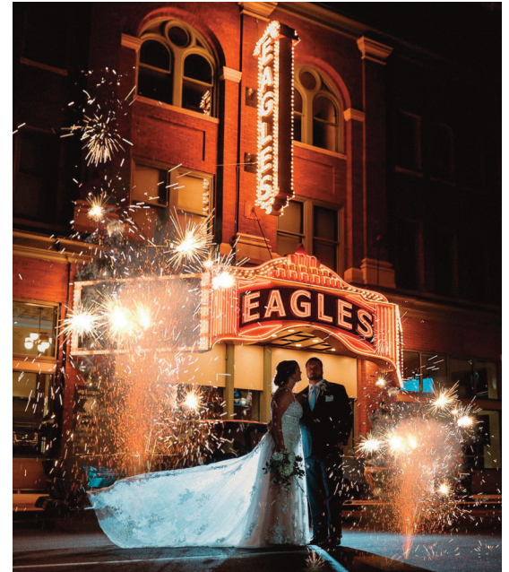
The Eagles ballroom and marquee served as a popular backdrop for 15 weddings in 2021. The multi-year renovation of the five-story venue was made possible in part by our generous supporters.