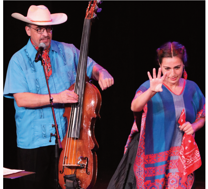
Taking students on a journey through Mexican music, the Honeywell Arts In Education Student Matinee series presented Sones de Mexico Ensemble on the Eagles stage. Your support helps bring these matinee opportunities to regional schools.