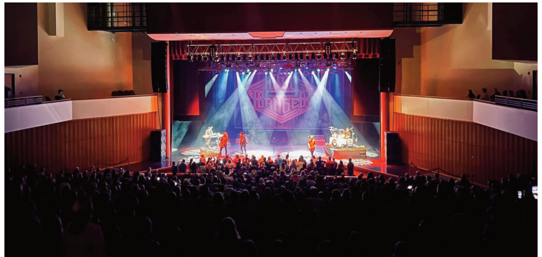
Live shows returned to the Ford Theater stage with Night Ranger performing to a nearly sold out crowd in July. During the pandemic shutdown which continued into early 2021, your support allowed us to focus on strategic growth of programming and helped us resume our offerings without missing a beat.